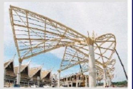
Steel Column Structures