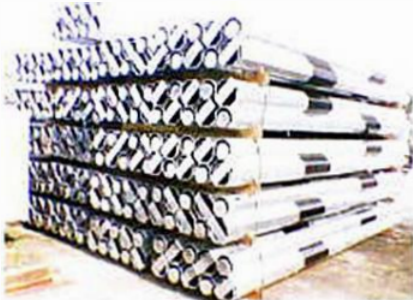
» Typical packaging of steel pole